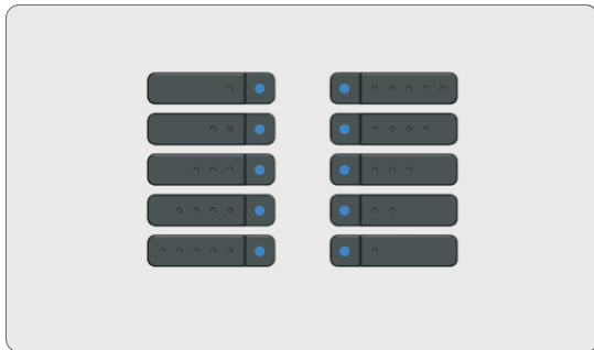
product ref: 123D2