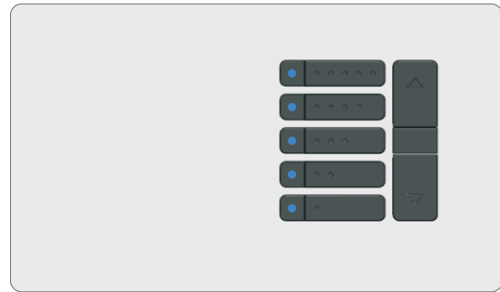
product ref: 123D1

Five scene set panel with master raise and lower buttons and infra-red receiver